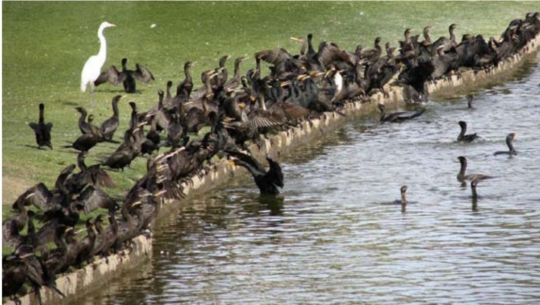
Figure 3. Congregation of about 100 cormorants, mostly Neotropic with several Double-crested Cormorants at Kokopelli Golf Course in Gilbert, AZ.

already exceeded 500 individuals (figure 3). The highest densities have been observed at several residential lakes in Chandler and Gilbert, just upstream of Tempe Town Lake, and several gravel extraction company lakes on the Salt and Gila Rivers. However, it should be noted that the specific concentration locations are often temporary and are based on abundant populations of appropriate size fish. Once prey populations are reduced, these highly mobile cormorants readily move to other neighborhood lakes and ponds.