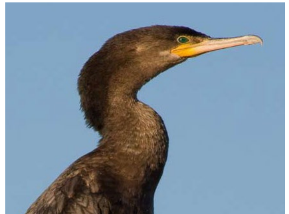
Figure 4. On this juvenile Neotropic Cormorant the yellow orange gular pouch is similar in color to that of a typical Double-crested Cormorant, but note the color and feathering of the supra-loral and the dark breast.

The identification of juveniles of both species can be challenging. These birds share many of the differences noted above for adults, especially the shape of the gular pouch and differences in the supra-loral. Juveniles of both species are lighter and browner than adults. Juvenile Neotropics are usually a fairly uniform dark brown with at most only slightly paler underparts. Juvenile Double-crested usually have light gray breasts which are sometimes paler gray on the upper breast, neck, and throat. Some juvenile Neotropics are especially challenging because they may have facial skin color that is brighter than adults (Clark 1992) and, therefore, more closely approach Double-crested. A key feature in separating these juveniles is the supra-loral which is dark feathering in Neotropics, but is fairly bright orange-yellow or yellow-orange bare skin and uniform in color with the gular pouch in Double-crested (figures 4 & 5; Patten 1993).