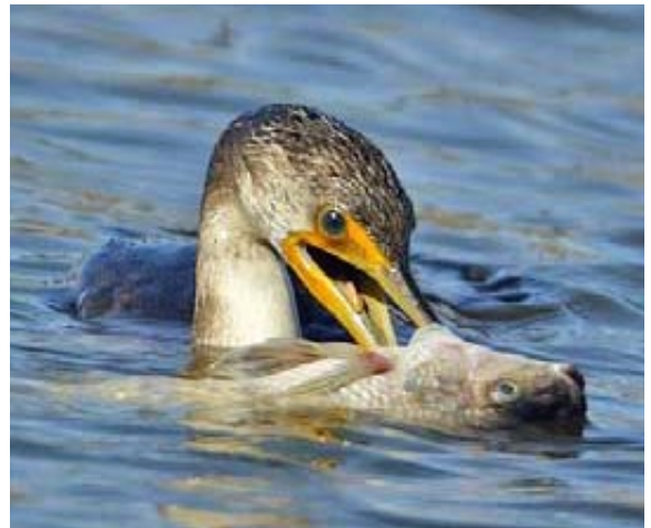
Figure 5. On this juvenile Double-crested Cormorant note the bare skin and color of the supra-loral and the pale throat and upper breast.