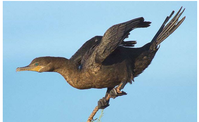
Figure 1. Adult Neotropic Cormorant, Gilbert, AZ.

It should be noted that 99 percent of the numbers in figure 2 routinely come from only two Christmas Bird Counts along the lower Salt and adjacent Gila Rivers immediately southwest of Phoenix in Maricopa County. Furthermore, it was determined that high densities and diversity of wintering aquatic birds (including cormorants) were using the numerous urban lakes, ponds, and canals within the greater Phoenix metropolitan area, and that more than 95 percent of these water bodies are not included in any local CBC. The Phoenix Area Urban Aquatic Bird Survey was established in 2006 to collect information of water birds using these water bodies during winter. This single-day urban survey in mid-January produced a tally of 178 Neotropic Cormorants in 2006 and 191 individuals in 2007. In 2008, a high count of 1357 Neotropic Cormorants was remarkable and further supports the large population increase of this species in Maricopa County. More than 90 percent of these birds are consistently found within the city limits of Chandler, Gilbert, Phoenix, and Tempe. ( http://azfo.org/namc/IndexphoenixUrban.html ).